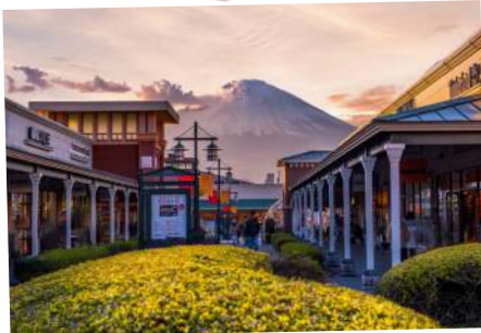
御殿场奥特莱斯 Gotemba Premium Outlets