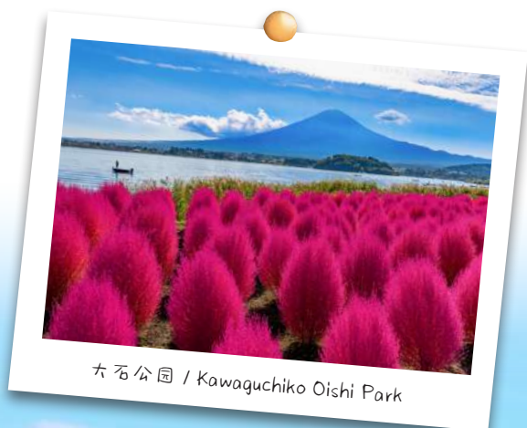
大石公园 / Kawauchiko Oishi Park