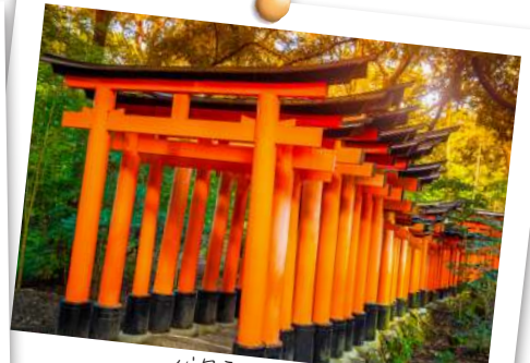
伏见稻荷神社 Fushimi Inari Shrine