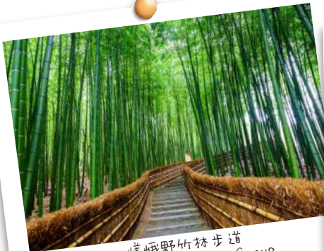
嵯峨野竹林步道 Arashiyama Bamboo Grove