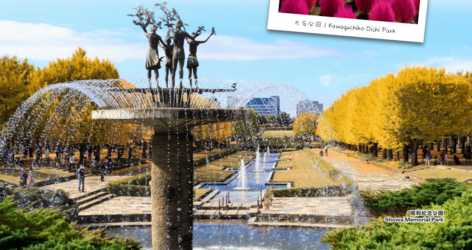
昭和纪念公园 Showa Memorial Park